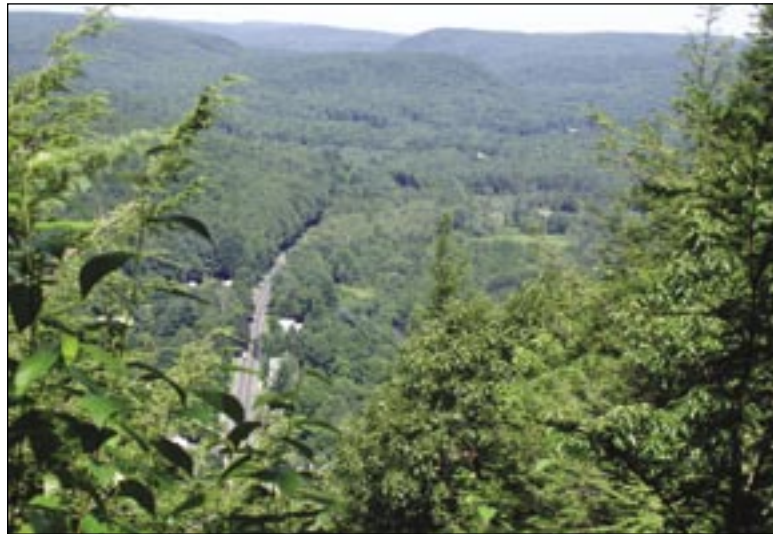
View from Jones Mountain

The final agreements on the land transaction are being negotiated as this newsletter goes to press. We look forward to celebrating the completion of this landmark cooperative venture!