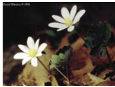
Dutchman's Breeches, Bloodroot and Trout Lily.