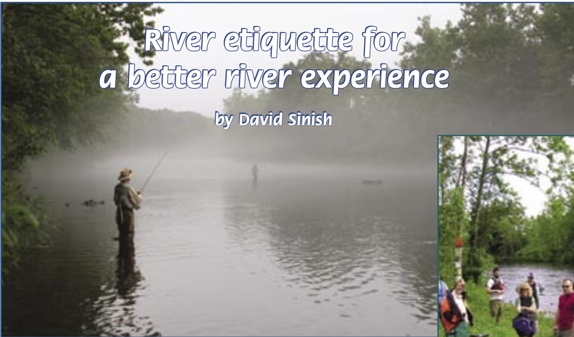
At left, the peace of flyfishing.