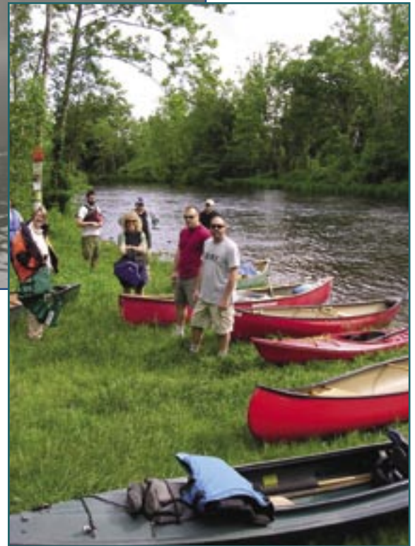
Below, the excitement of a trip by canoe down the river.

The Farmington River offers so much to so many people. From fly fishers to worm drowners, intrepid hikers to gawking automobile passengers, skilled boaters to floundering first time floaters, and natural resource students to those unaware of the natural resource values at hand. All these users, all in one place, and all at one time. No wonder there is a need for some guidelines for behavior so that all can have a safe and enjoyable experience.