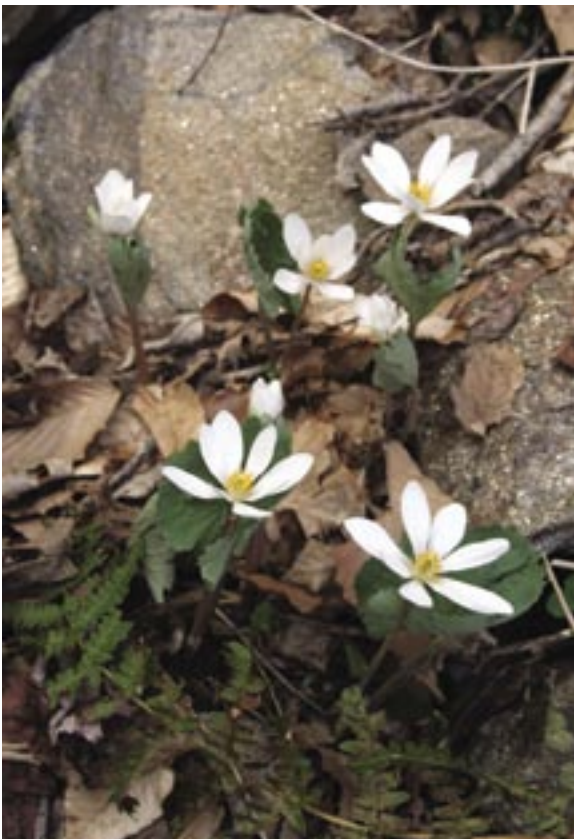
One example of the many fine photos you'll see at the W&S Art Exhibit, which opens September 18 and runs through October 20.

Annual FRCC Open House and W&S Art Exhibit September 18!