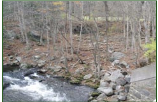
Site of the Richard Smith Ironworks

When it was completed there were a forge,