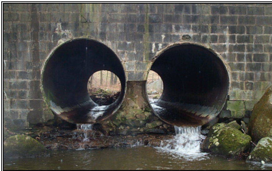
Figure 2. Example of culverts perched above streambed.

The most common stream crossing problems in Connecticut are perched culverts that are situated above the elevation of the stream bottom at the culvert outlet (downstream end) that present obvious physical barriers to upstream fish passage (Figure 2). Perched culvert conditions are the result of improper installation or are created over time by years of excessive scour and erosion of the streambed at the culvert outlet. Freeze-thaw conditions can also lead to culvert perching.