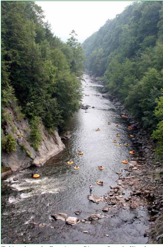
Tubing down the Farmington River at Satan's Kingdom