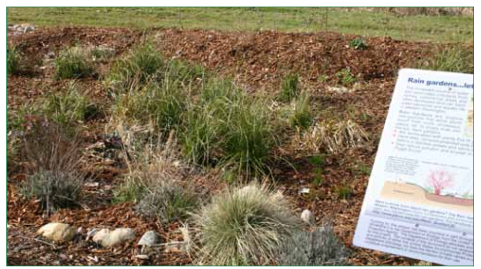
A rain garden, one of the effective components of LID (also illustrated at top of article).

To learn more about LID or Barkhamsted's LID committee, please visit: http://barkhamsted.us/BoardsCommissions/LowImpactDevelopmentAdvisoryCommittee/tabid/156/Default.aspx