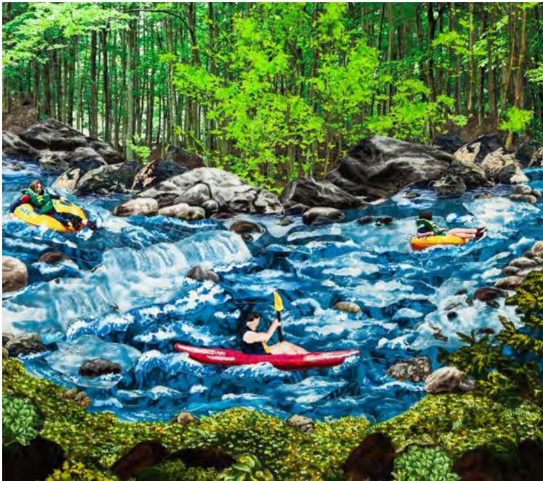
High Bank Rapids by Susan Cane, Canaan, CT Farmington River Quilt, Section 10.

There is an initiative from American Rivers and American Whitewater Association to protect 5,000 more miles of river in the United States. This includes 62 miles of the Lower Farmington River and Salmon Brook, which received designation in 2019. As of September 2019, the administrative structure of the designation is being developed.