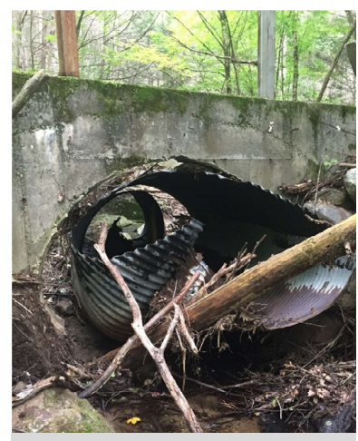
Improper crossings can be damaged during flood washout, which creates a severe barrier to aquatic passage.

FRWA has continued work in assessing stream crossing conditions within the Farmington River Watershed in order to determine structural integrity as well as the ability of passage for aquatic and terrestrial wildlife. These assessments can be useful in determining which crossings require repair for the safety of human lives and property, and they also provide insight into the ability of aquatic organisms - such as diadromous fish - to move throughout the watershed. For instance, a collapsed culvert can impede the migration of American Shad, and a crossing that is too narrow for the stream channel it covers can cause deposits of sediment that will prevent the eggs of Atlantic Salmon from reaching maturity. Crossings that are designed inadequately may also fail in the event of flood conditions, which can cause human safety risks and property damage. In working with the North Atlantic Aquatic Connectivity Collaborative (NAACC), FRWA intends to identify crossings that are in need of repair or replacement within the Farmington River Watershed.