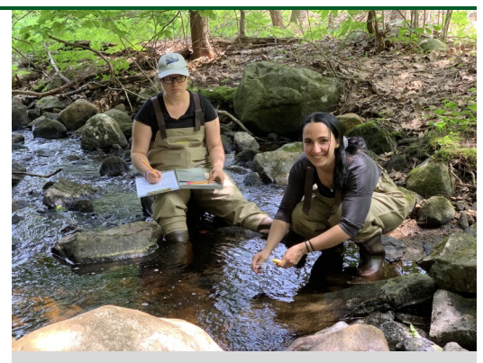
FRWA interns deploying a HOBO in an unnamed tributary of the Mad River.

Fifteen sites were monitored for bacteria, chemicals, nutrients and minerals from April to November. These sites have been monitored for long-term data for the past 15 years. Analysis of the data is conducted in the MDC laboratory. Results are complied and shown of the FRWA website. www.frwa.org